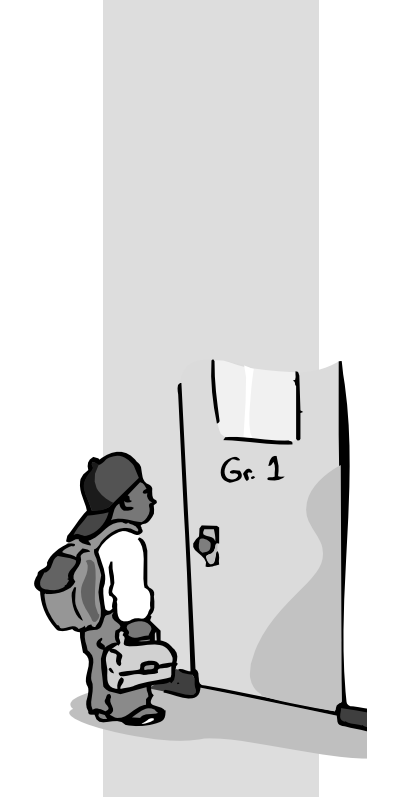
An IEP will state: present levels of academic and functional achievement and functional performance; annual goals; how progress will be measured; what special education and related services will be provided, including how often and by whom; to what extent the child will participate with other students in the general curriculum; what modifications, if any, will be used for instruction; assessment information; and, as appropriate,, transition services. (preplanning for high school and beyond).